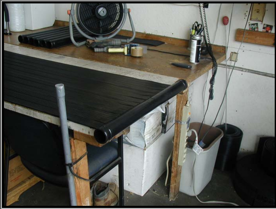
This end complete.